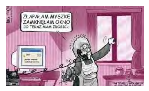
I grabbed the mouse and closed the window. What am I supposed to do now? (Google Images: elderly people, found 11th May, 2013)

Such experiences are a source of frustration for the older generation accustomed to a different style of functioning in familial, social and professional relations (e.g. the relationship between a student and his/her instructor). Stereotypically, we attribute computer illiteracy to elderly people. We also assume they do not understand computer terminology, which is to a great degree the result of neosemantization, i.e. giving a new meaning<sup>6</sup> to words which are already in use – as illustrated in the following cartoon: