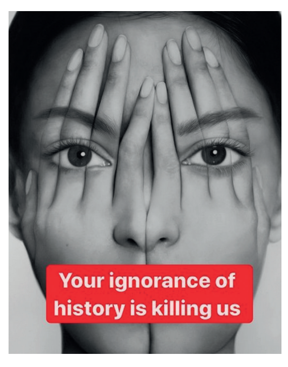
Fig. 4. Your Ignorance of History is Killing Us. Photo: courtesy of Tigran Tsitoghdzyan [at:] https://www.facebook.com/TigranTsitoghdzyan.

Bezemer and Kress (2008: 166–195) argue that the receivers understand information differently when the text is delivered in conjunction with a secondary medium, such as image or sound, than when it is presented in alphanumeric format only. In this case the text draws attention due to both the originating site and the site of recontextualization. Recontextualizing an original discourse/text within other mediums creates a different sense of understanding for the audience, and this new type of comprehension can be controlled by the types of media used. In our case, the high frequency signal word kill – a semiotic sign typical of war discourse - has been preserved in the two recontextualized metaphor forms of Fig. 3 and Fig. 4. The visual image on the background in all the variants is nearly the same. The contrasting colors (black and red), the structure of the verbal message, the present continuous tense have also been preserved. The subject of the previous action - silence , has been modified into neutrality and ignorance of history . As a result, the emotional charge and the impact on the audience have grown immensely because the new