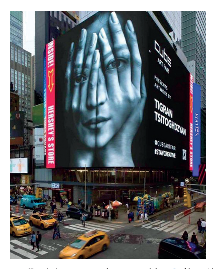
Fig. 2. The Times Square Billboard.

Immediately after the image was publicized, the traditional semiotic resources interacted and combined through information technologies, design and arts to result in new modes of expression. The artistic image went viral in the news media, taking new multimodal forms - it became a slogan which appeared on the social media as a hashtag and a meme; it was used as a profile picture; animated texts and 3D effects were added to it; the first official English language Armenian weekly published in the US since 1932, the Armenian Mirror-Spectator (2020), dominated Times Square by a thirty story tall billboard (Fig. 2) along with a live video material displaying the image located in the street.