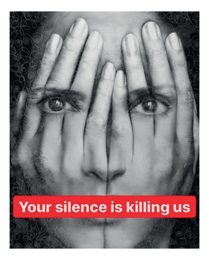
Fig. 1. Your Silence is Killing Us. Photo: courtesy of Tigran Tsitoghdzyan [at:] https://www.facebook.com/tigrantsitoghdzyan?

The prevalence of metaphor framing is obvious in news schemas documenting the analysis of the war over the period of forty-four days. The recurrent use and recontextualization of the warfare metaphor during the given period may be actually a proof of its effectiveness as a rhetorical tool deserving further scrutiny.