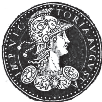
Fig. 3. Portrait of Victoria. STRADA 1553: 151.

Epitome thesauri antiquitatum, hoc est, impp. Rom. Orientalium & Occidentalium Iconum, ex antiquis Numismatibus quam fidelissime deliniatarum , was written and published by Jacopo STRADA, an antiquarian, collector and numismatist, in 1553 19 . Gallic Victoria is present there in a very interesting way. Referring to details presented in the HA , the work features some incomplete episodes from her life 20 . Then the Epitome presents the numismatic history of Victoria in a number of ways. It mentions coins which “in cuius memoriam [...] cusi sunt, quorum forma apud Treuiros extat” 21 . It also gives a description of one of those nummi ; STRADA notes a difficulty connected with the deciphering of a Greek ( sic ) inscription on the early and damaged specimens: “Numus hic æreus in altera parte imaginem refert aquilæ expansis alis fulmini insidentis. Inscriptio est Græcis characteribus, quæ tamen propter vetustatem cognosci non potuit”. There is an obverse monetary representation of Victoria. Her bust is enhanced by a titulus : IMP VICTORIA AVGVSTA (fig. 3) 22 .