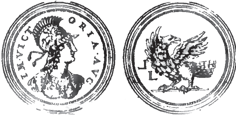
Fig. 5. Coin of Victoria. STRADA 1615: 150, n° 209.

The description of this piece was developed by a Milanese scholar, Francesco MEZZABARBA (Mediobarbus, 1645–1697) in his Imperatorum Romanorum numismata (1683):