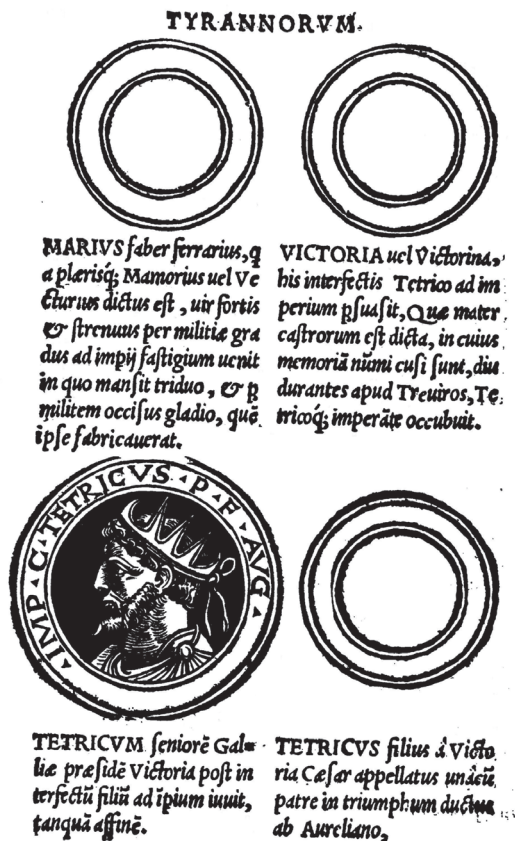
Fig 1. Page of HUTTICH 1525: 43v.

Some illustrative material was soon created. It was the work of an antiquarian and numismatist, Guillaume ROUILLÉ. In his Promptuaire des medalles of 1553 (a Latin edition, Promptuarium iconum insigniorum a seculo hominum , was published in the same year), word and image occupy an equal amount of space in the description of the ancient figure 13 . Victoria seu Victorina was therefore mentioned in commentaries devoted to those Gallic usurpers, to the extent to which it was described by ancient Roman writers. Victorinus' mother was also described in a relatively comprehensive commentaire , in which she received separate treatment. All in all, ROUILLÉ collected biographical notes dispersed in various loci of the lives of rulers and usurpers in the HA, although he basically did not go beyond them 14 . In reference to Victoria, he also repeated the following: "fut par les gens de guerre appelee Mere du camp: ce qu'elle accepta, & ainsi se nomma. Elle feit battre monnoye d'aloÿ, d'argent & d'or" 15 . However, the novelty consisted in the "numismatic portrait" of the protagonist who was described. The medallion shows her bust en profil , which is identified by an inscription: VICTORIA AVG (fig. 2).