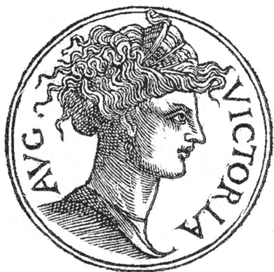
Fig. 2. Portrait of Victoria. ROUILLÉ 1553: 72.

The works of J. HUTTICH and of G. ROUILLÉ, despite the considerable differences which they manifest, adhere to a similar convention. One may classify these works within the group libri di medaglie / Bildnisvitenbücher , i.e. collections of biographies of well-known figures enhanced by monetary portraits, which had been popular since the appearance of the work of Andrea FULVIO: Illustrium imagines (1517) 16 . However, they occupied a marginal place in the discussion about the essence, peculiar nature and cognitive significance of numismatic specimens which was in progress at that time. Nevertheless, in both works the